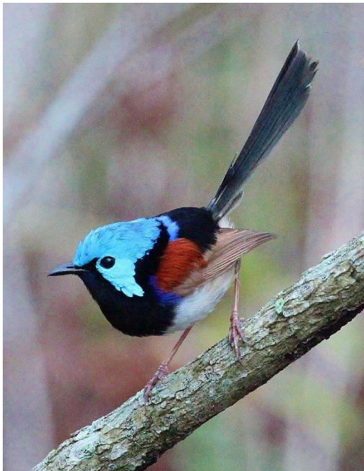
Variegated Fairywren

NIGHT (September 28): Pullman Sydney Hyde Park, Sydney