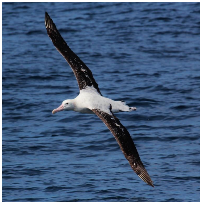
Wandering Albatross at sea off Sydney

October 2, Day 5: Sydney Pelagic Boat Trip. The rich marine waters off the coast of Sydney regularly produce some of the most spectacular pelagic birding in the southern hemisphere. In early spring, schools of baitfish attract flocks of shearwaters. There are often lingering albatrosses from winter and a good mix of both warm and cold water oceanic birds. Among the likely possibilities are no less than four species of albatross including Black-browed, Yellow-nosed, White-capped and the unbelievably huge Wandering. These, without doubt, are some of the most beautiful of all seabirds. Other species we may encounter include Little Penguin (scarce); Wedge-tailed, Short-tailed, Fluttering, Hutton's and Flesh-footed shearwaters; Southern and Northern giant-petrel; Gray-faced and Providence petrels; Australasian Gannet; White-faced and Wilson's storm-petrel; and Brown Skua. Almost any rarity is possible such as Kermadec Petrel, Red-tailed Tropicbird, and perhaps Buller's or Royal albatross. We have an excellent chance to encounter Humpback Whales and a variety of dolphins also.