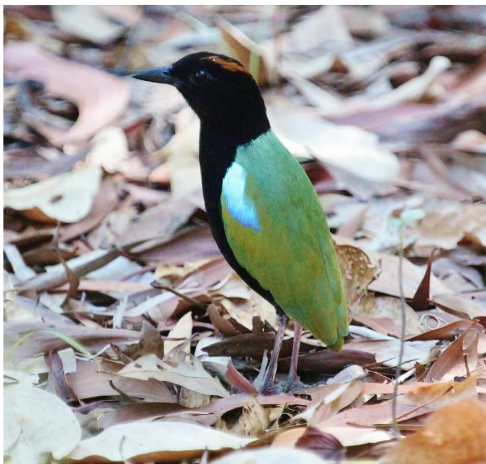
Rainbow Pitta at Howard Springs

October 6, Day 9: Birding the Darwin Area. In the morning we will explore Howard Springs Nature Park, a delightful area of monsoon vine forest and home to our target bird, the beautiful Rainbow Pitta. At this time of the year they should be quite vocal, which will increase our chances considerably of finding it. There will be nonstop birding action in the morning as we will also try to seek out Brush Cuckoo, Varied Triller, White-bellied Cuckooshrike, Shining Flycatcher, Northern Fantail, Gray Whistler, Dusky and Blue-faced honeyeater, and Yellow Oriole. If we have early success, we will explore the mangroves for Australian Yellow White-eye, Mangrove Gerygone and, if the tides are good, hopefully the rarely encountered Chestnut Rail. Before our midday siesta we will visit Knuckey Lagoon, which will provide our first taste of the incredible abundance of wetland birds in the Top End. We will find huge numbers of Magpie Geese and in amongst them Radjah Shelducks, Brolga, Black-necked Stork, Whiskered Terns, Australian