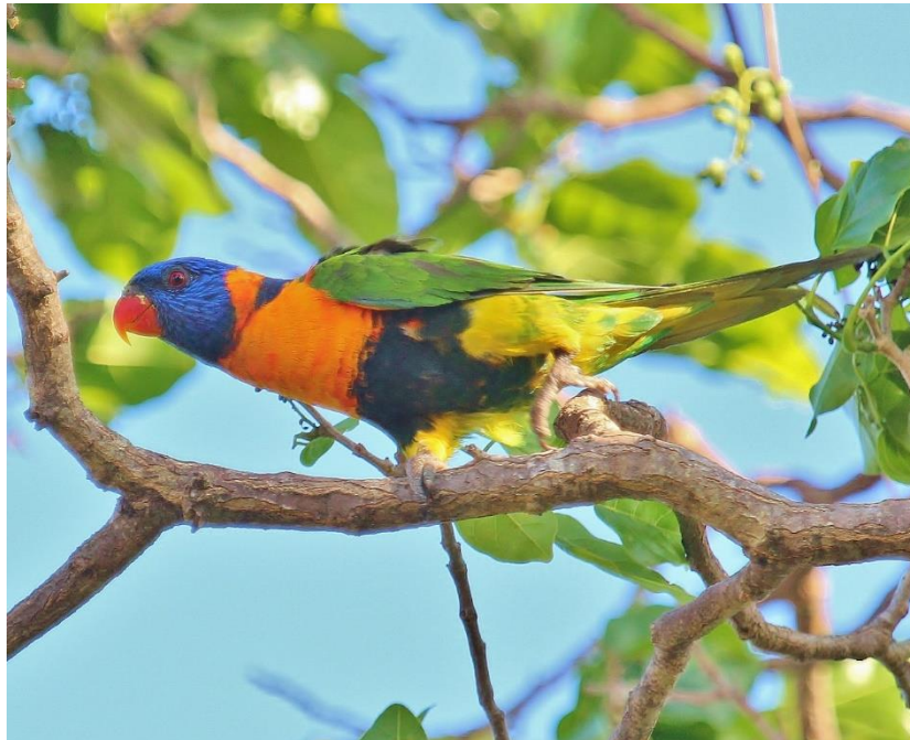
Red-collared Lorikeet is a common species around Darwin

October 5, Day 8: Travel to Darwin; Afternoon at East Point Reserve. This morning we will transfer to the airport in time for the 8:15 a.m. departure of Qantas Flight 840 to Darwin, which is scheduled to arrive in Darwin at 12:20 p.m. (subject to change).